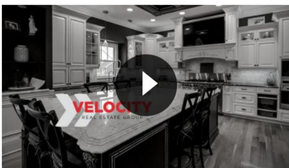
A day in the life of a real estate agent Velocity Sells (4 min)

Real Estate Brokers Job Description GadBaller (2 min)