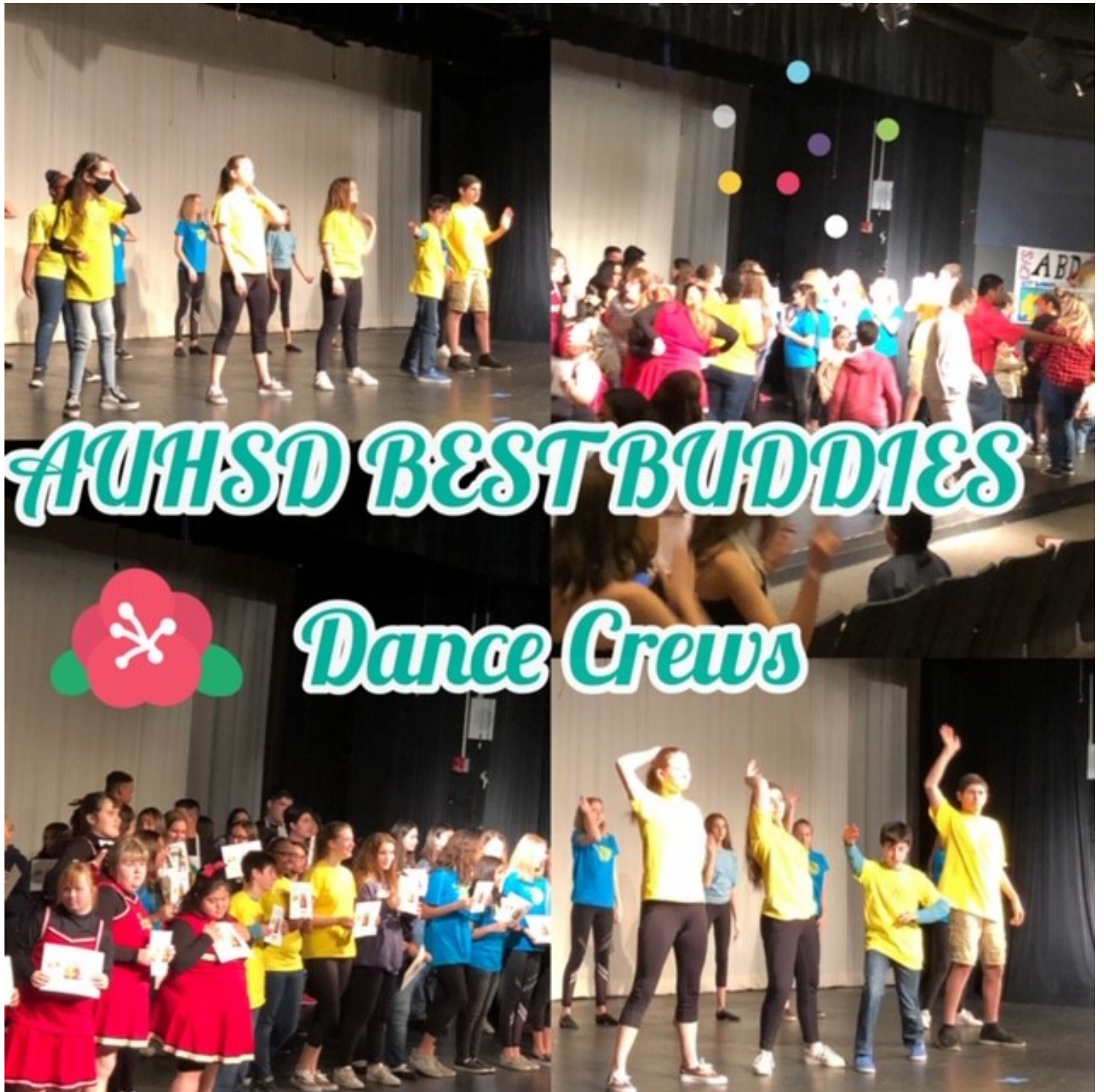
Best Buddies from Autism focus and dancers rehearsed at lunch and then performed at Cypress High school with clubs from across the district and the Hope Cheerleaders. What a heartwarming night!