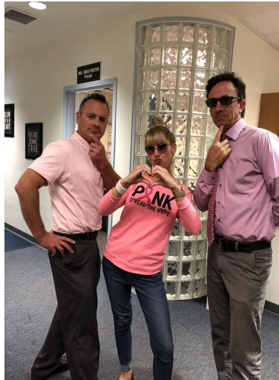
Pink for Breast Cancer